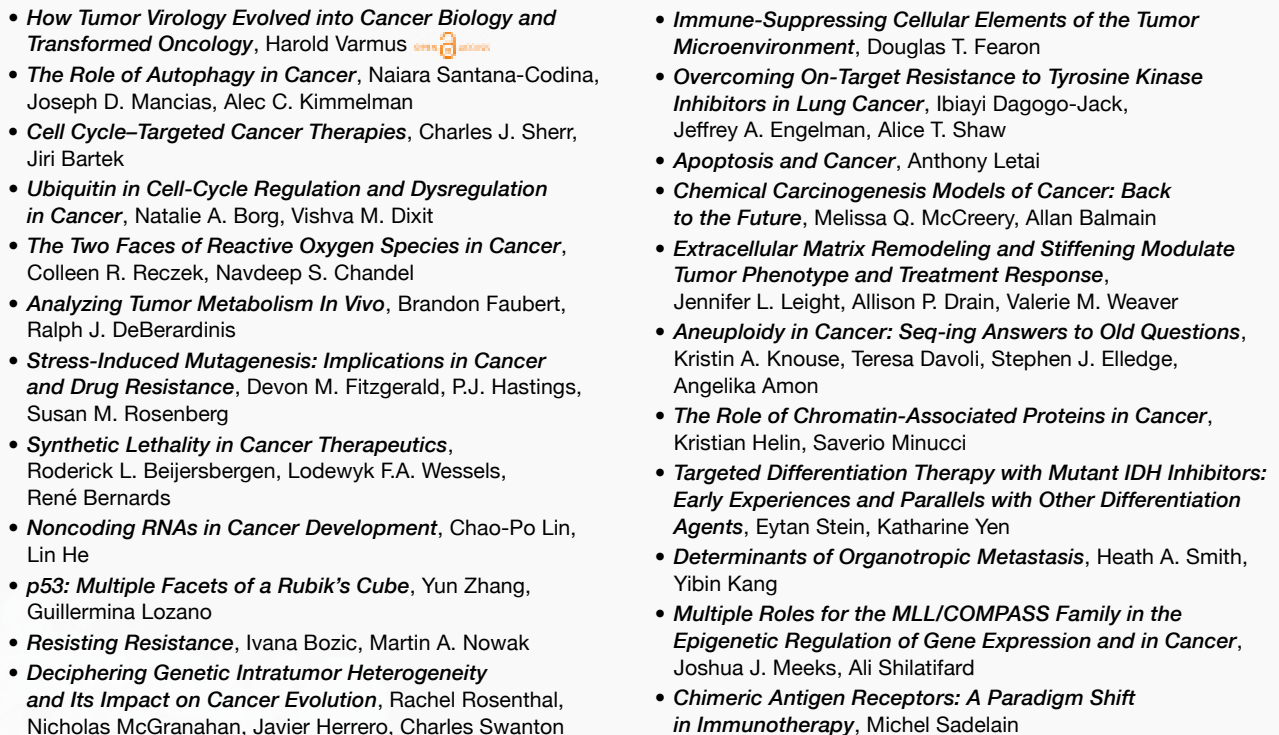
TABLE OF CONTENTS FOR VOLUME 1:

The Annual Review of Cancer Biology reviews a range of subjects representing important and emerging areas in the field of cancer research. The Annual Review of Cancer Biology includes three broad themes: Cancer Cell Biology, Tumorigenesis and Cancer Progression, and Translational Cancer Science.